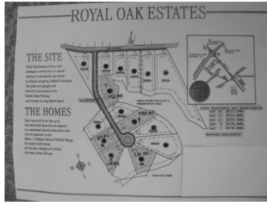
Beautiful Cedar Run

--- Information herein deemed reliable but not guaranteed --- Copyright 2005 Ocean County Board Of Realtors © 03/25/2010 04:37 PM