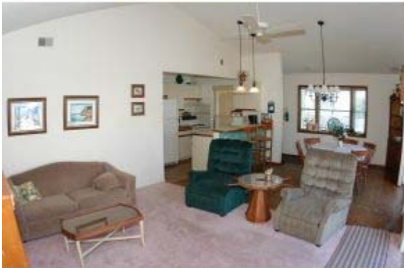
Open Floor Plan