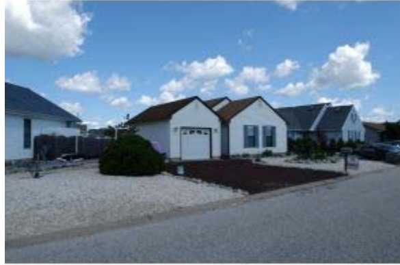
Lot is 90 x109 x 30 x 81