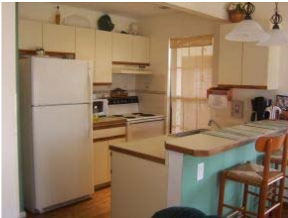
Newer Kitchen w Breakfast Bar