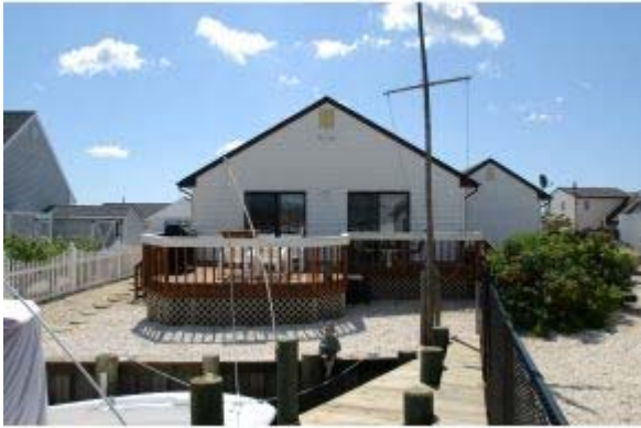
New Vinyl Bulkhead