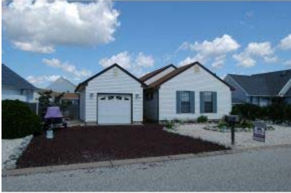
East Point Lagoon Waterfront