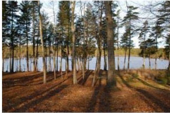
Quiet and Serene Views