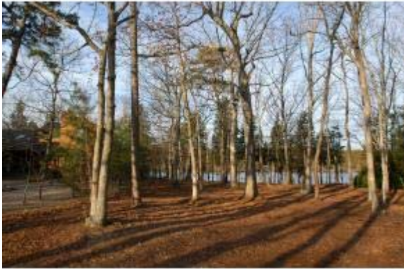
New Construction Ready