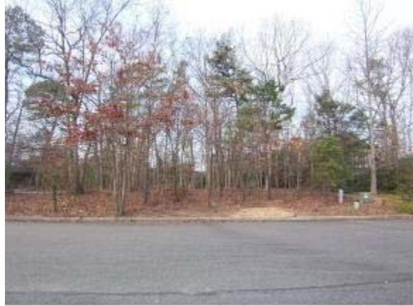
Prestigious Deerlake Park