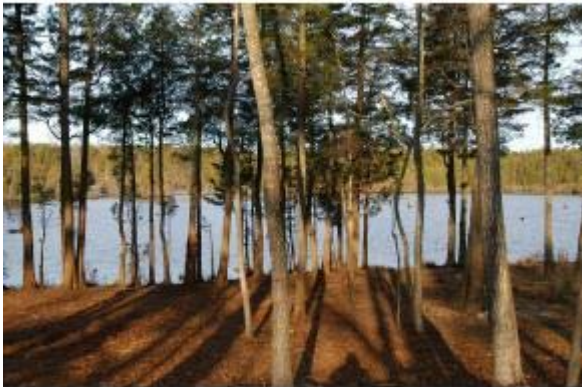
Close to the Ocean and LBI