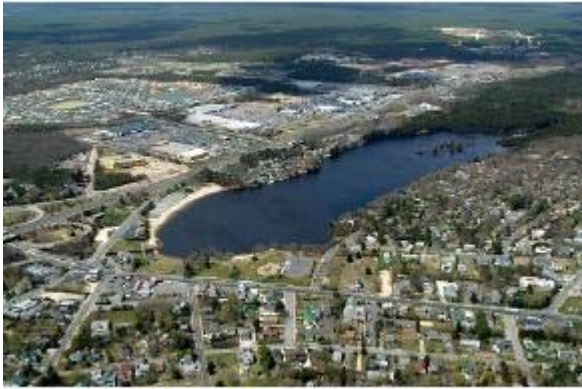
Manahawkin Lakefront Lot