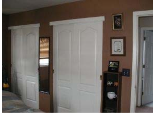
Leading to bedrooms