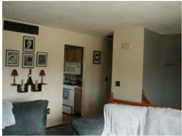
More Living room